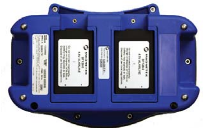
Main battery and spare battery packs