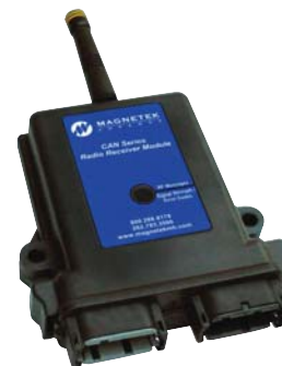
CAN-6 Receiver shown