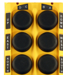
Labels Located Next To Buttons for Easy Visibility and Durability