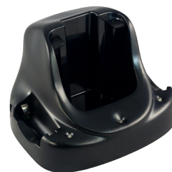
Charging Cradle Available for Easy Recharge