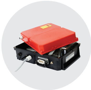
Opened MC-BUE2 Receiver Unit