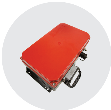
Standard MC-BUE1 Receiver Unit