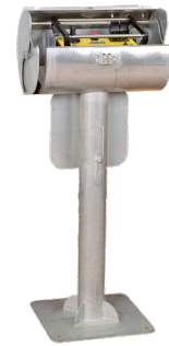
Pedestals for operating and storage for terminals

Supply voltage receiver: 12 / 24 VDC; 110-240 / 380 VAC 50/60 Hz MC-MINI receiver units upon request.