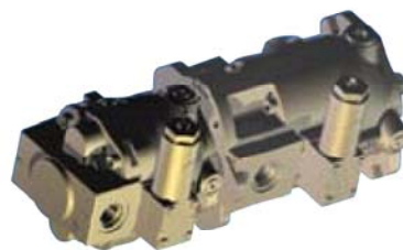
PD 18cc mounted to PD 28 through drive