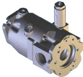
P1/PD 28cc through drive